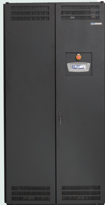
Power distribution unit